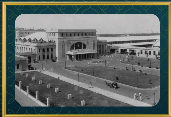
Mumbai Central Station