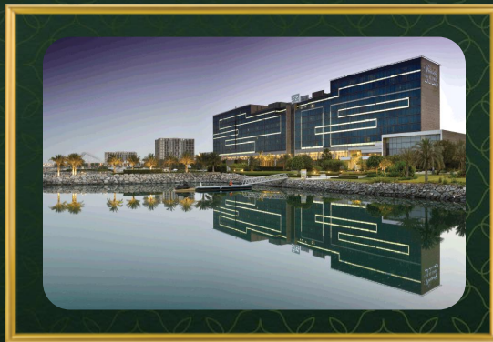
Fairmont Bab Al Bahr, Dubai