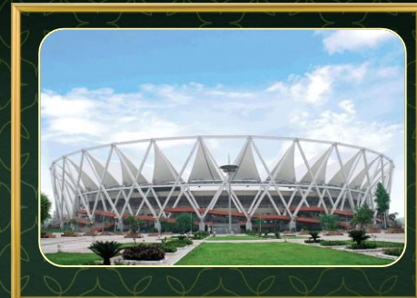
Jawaharlal Nehru Stadium