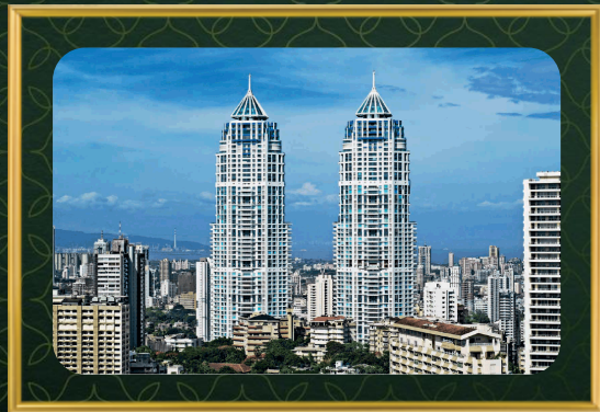
The Imperial, Mumbai