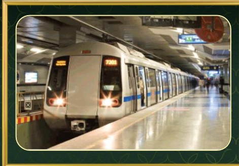
Barakhamba Metro Station