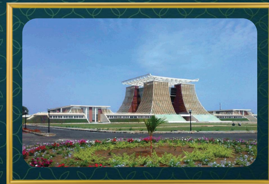
Seat of Ghana