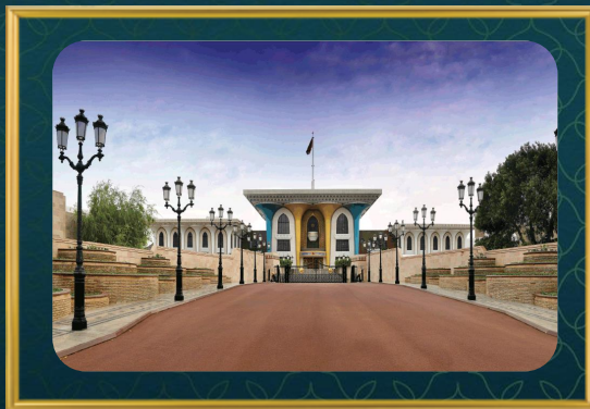
Palace of the Sultan of Oman