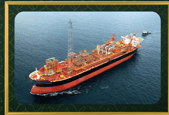
FPSO Armada Sterling-I